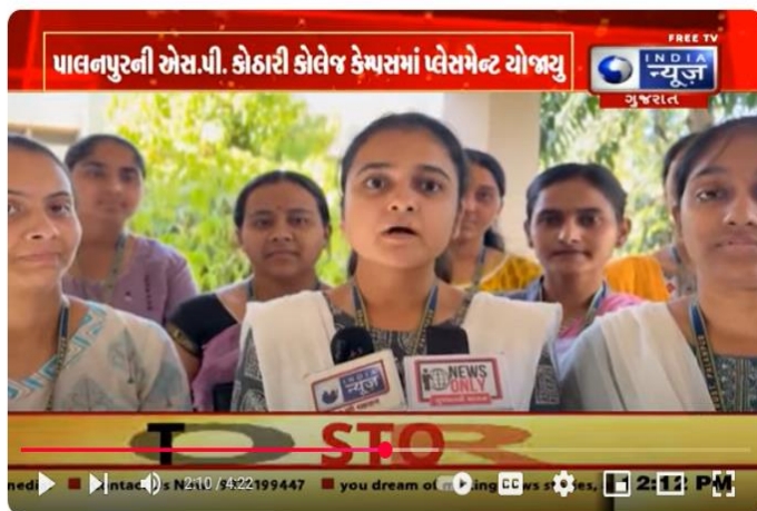
પાલનપુરની એસ.પી. કોઠારી કોલેજ કેમ્પસમાં પ્લેસમેન્ટ યોજાયું - India News Gujarat